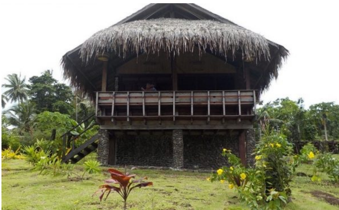
Chez Maureen Bungalows (after completion)

Through the combined efforts of skills development, destination marketing and market access, Vanuatu has seen more tourists travelling by air to our outer islands in recent years. Available data shows that annual international arrivals who have travelled to outer islands have grown in the past two years, despite the impact of Tropical Cyclone Pam in 2015 and the temporary closure of Bauerfield Airport in 2016.