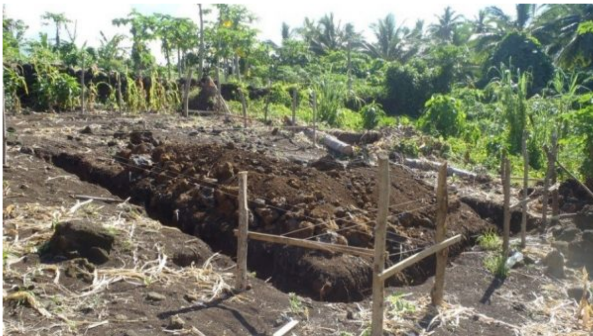
Chez Maureen Bungalows (before building)