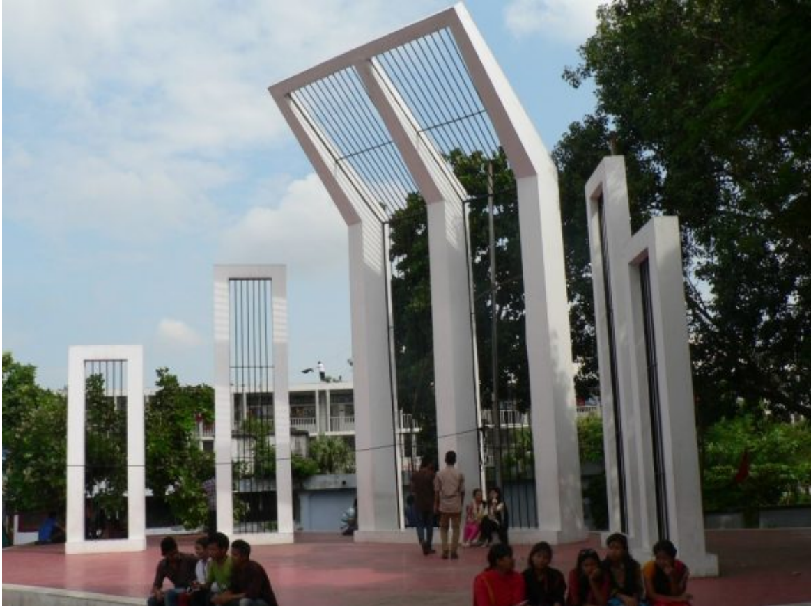
Shaheed Minar 'Martyr Monument', Dhaka

February 21 was chosen by UNESCO for International Mother Language Day , and has been observed worldwide since 2000. This year's theme is 'Linguistic diversity and multilingualism count for sustainable development'.