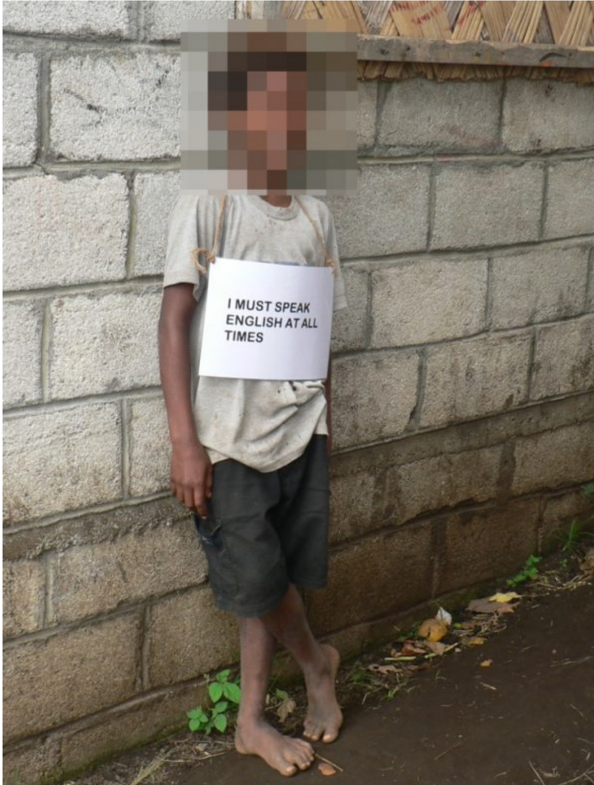
Primary student, Vanuatu

A few years ago in a Vanuatu primary school I took this picture of a student wearing a 'I must speak in English' dunce card as a punishment.