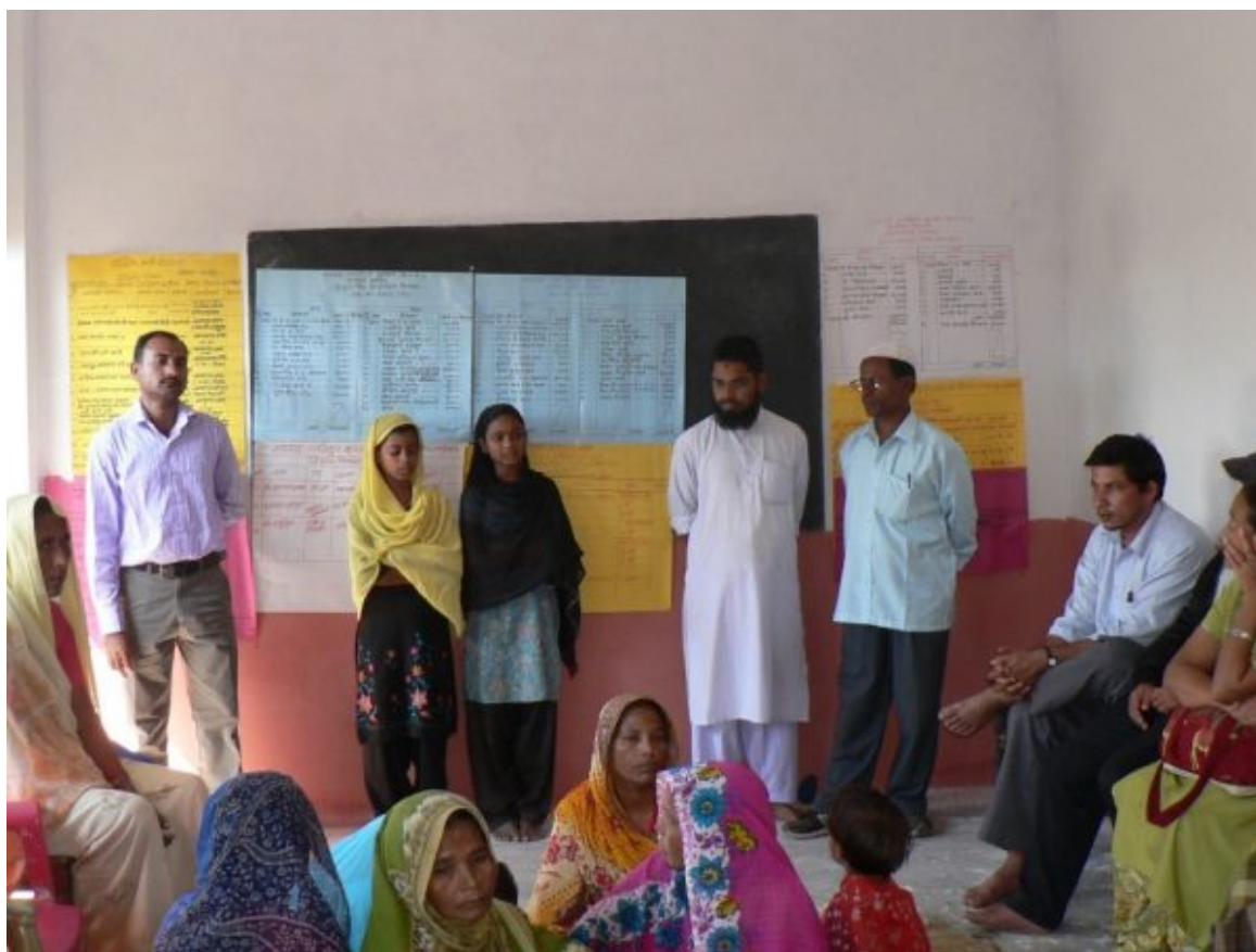
Madrasah, Nepal

In the South Pacific, where some language groups are very small, there are logistical challenges to the implementation of a mother tongue-based approach. However, this chapter of the ongoing language policy story in Vanuatu ends well – if not for the boy in the picture, then at least for others coming along after him – because from 2016, Vanuatu introduced a new language policy . Children start learning through their mother tongues or the lingua franca Bislama, before adding in English or French as the second language, and then French or English as the third language. It is an ambitious project, requiring the production of resources and pedagogical materials for 60 languages, but it will have clear benefits if it is well supported.