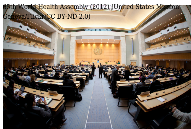
65th World Health Assembly (2012)