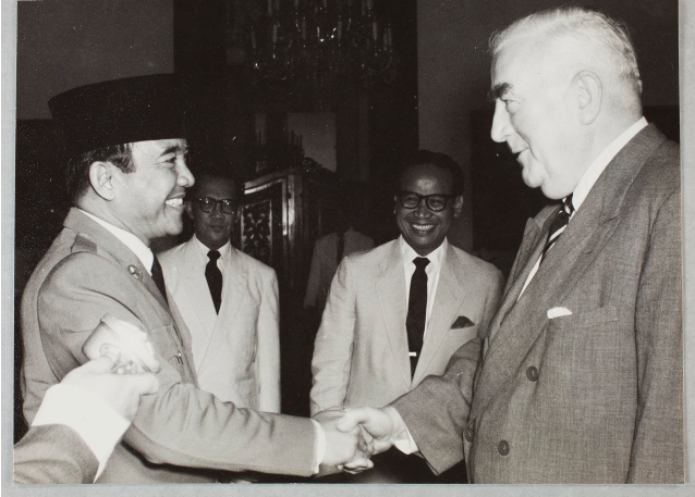
Menzies and Sukarno, December 1959