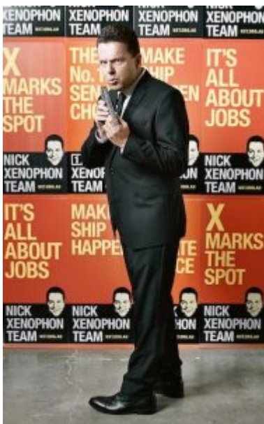
Nick Xenophon Team