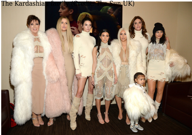
The Kardashians Family