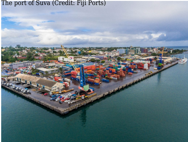
The port of Suva