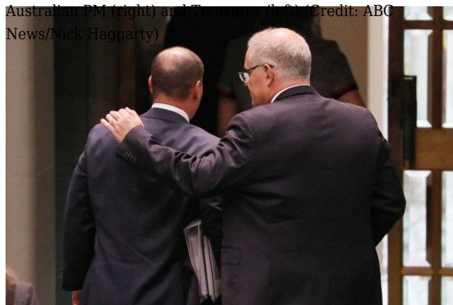
Australian PM (right) and Treasurer (left)